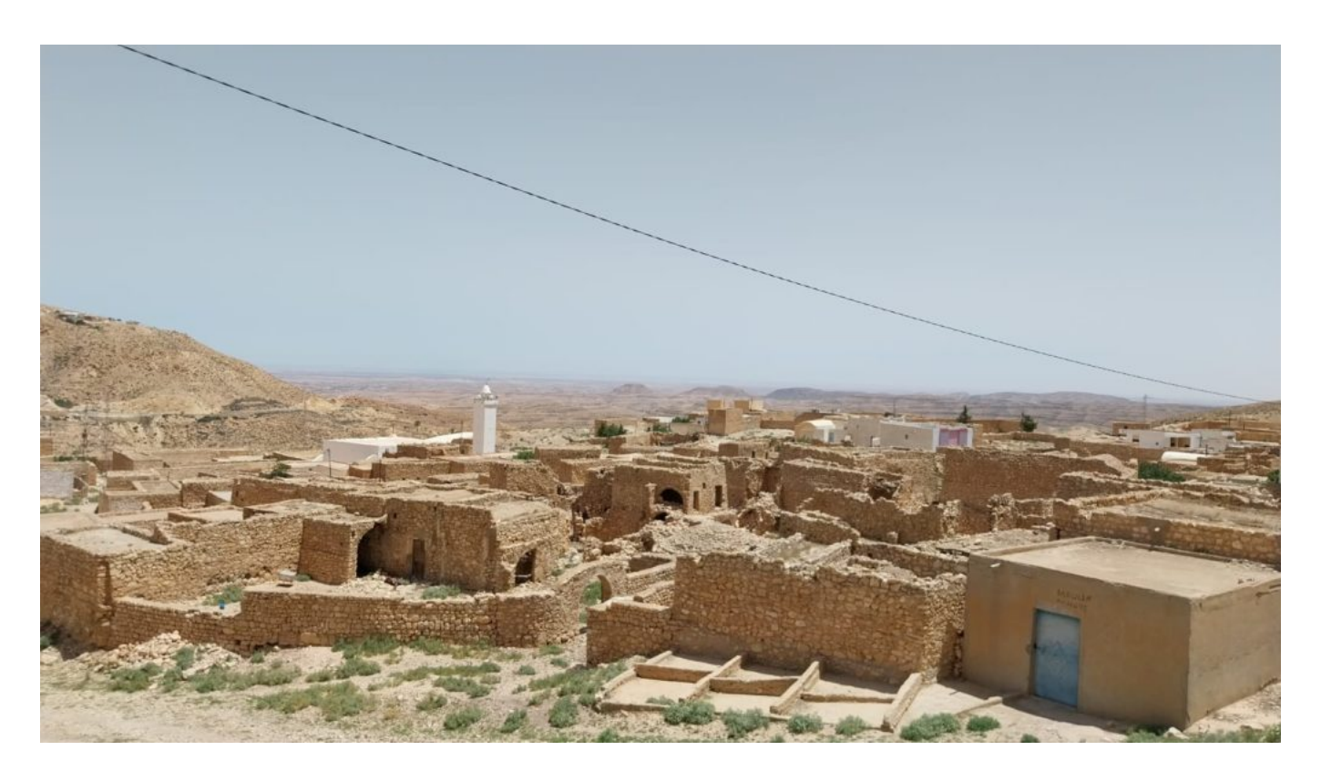
Why is cultural heritage important and what added value does it bring to the Dahar region?

Cultural heritage plays a fundamental role in the identity and influence of a region like the Dahar. It adds significant value to the region, both historically and in terms of tourism and economic development. Here's how cultural heritage is of paramount importance and adds value to the Dahar region: